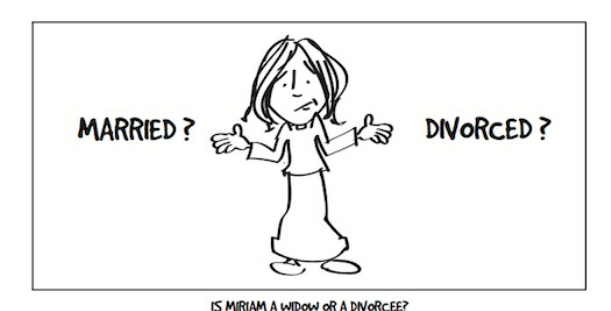
Tzvi Freeman 1/4 5/13/13